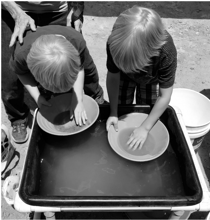
Walker Day Gold Panning Demo