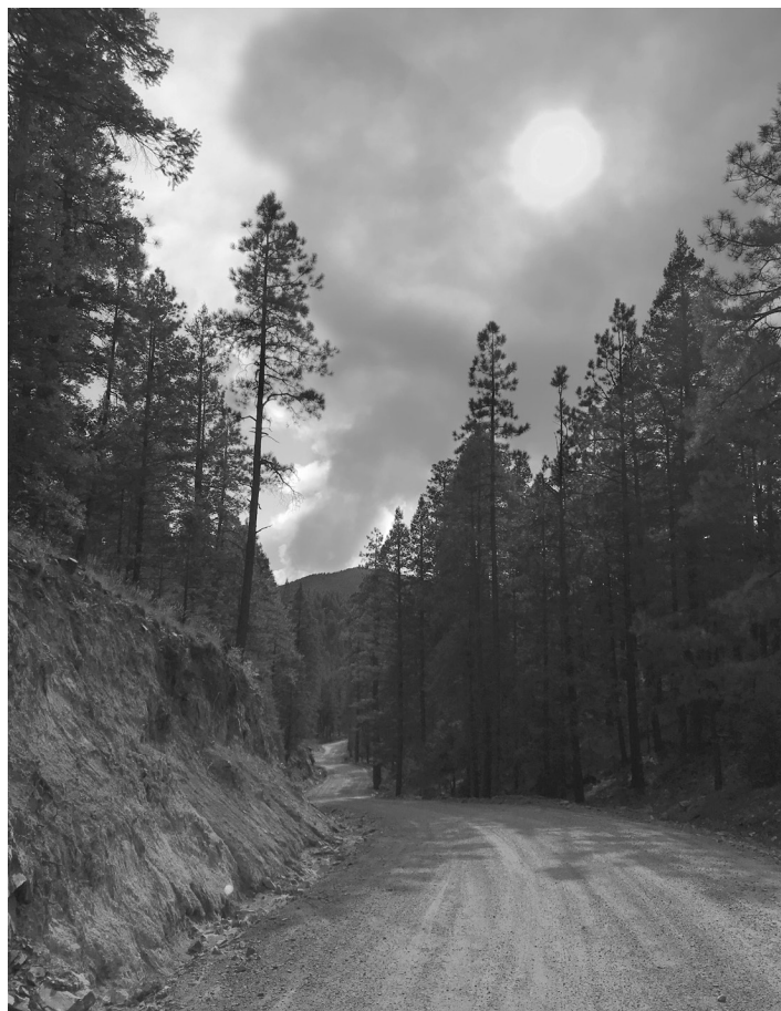
Smoke From Johnson Fire In Sept.

The department will continue to utilize its Facebook page at facebook.com/walkerfiredept to disseminate information as well as our longstanding email distribution list, but we would set the expectation that the Facebook page will be updated sooner than an email can go out.