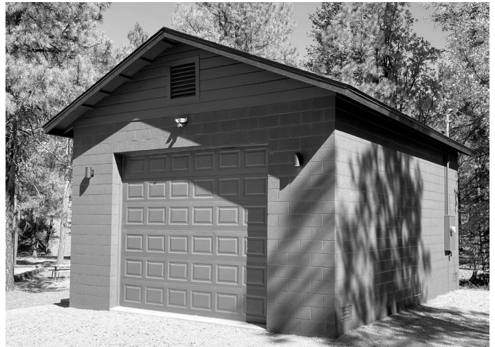
Potato Patch Garage Has Been Completed

This has been a project that has been discussed going as far back as 1985 and has been pursued in earnest since May of 2012 when the Board of Directors met