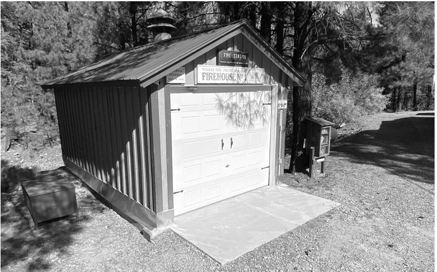
Firehouse Number 1 In Current Location With New Concrete Foundation