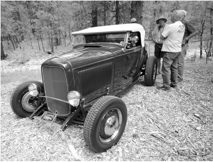
Walker Day Car Show

Though change is part of the seasons, some things are staying the same. WFPA continues to stay strong, vigilant and financially sound.