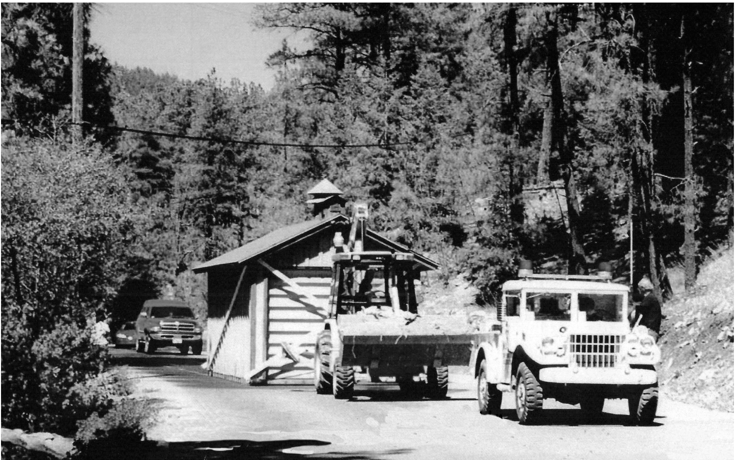
Firehouse Number 1 Being Moved From Humming Bird Lane To Current Location