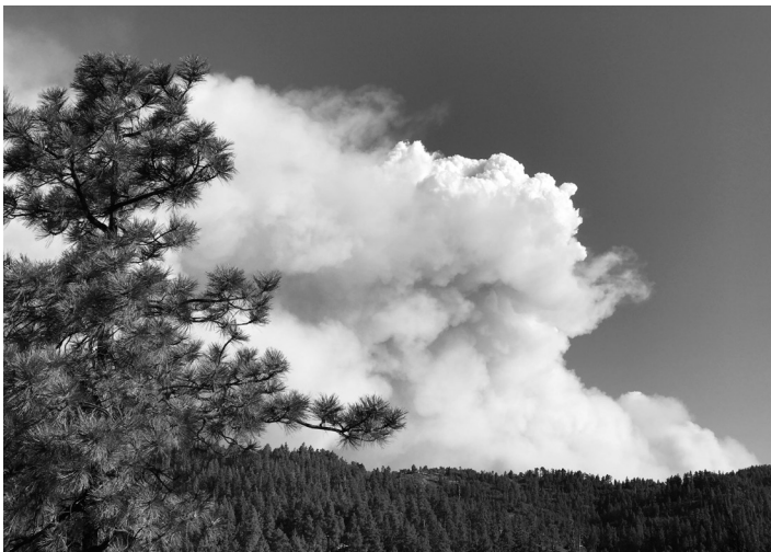
Smoke From Cellar Fire In July

Fire highlights one of the other challenges which was the peculiar monsoon season. It started late and didn't really provide the "normal" amount of moisture we might have expected. That lack of moisture likely contributed to the Johnson Fire in late September, which fortunately was extinguished by rain.