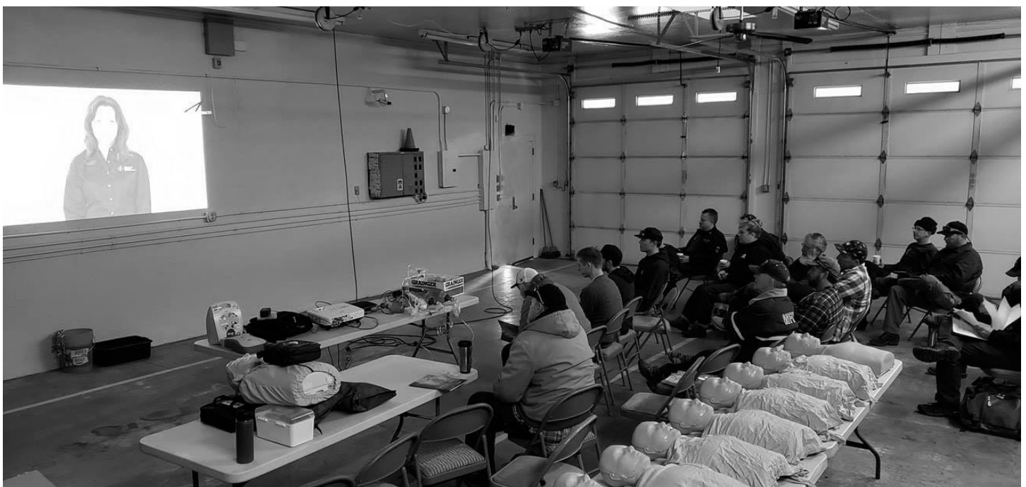
Walker Volunteer Firefighters Training

We have recently discovered the original volunteer list, as well as the plans and the list of materials for that building. It's great to be able to look back at our beginnings.