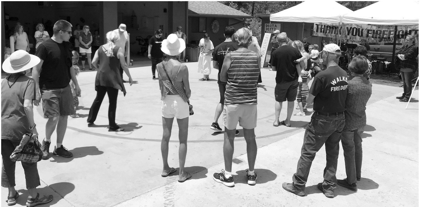
Walker Day Cake Walk

I enjoy seeing everyone coming together whether its at the monthly Board meetings (which everyone is welcome to attend) or enjoying pancakes on a nice Saturday