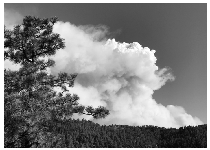
Smoke From Cellar Fire In July

Fire highlights one of the other challenges which was the peculiar monsoon season. It started late and didn't really provide the "normal" amount of moisture we might have expected. That lack of moisture likely contributed to the Johnson Fire in late September, which fortunately was extinguished by rain.