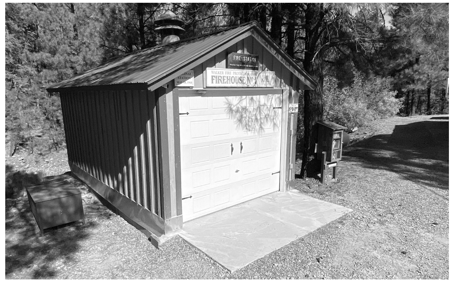
Firehouse Number 1 In Current Location With New Concrete Foundation