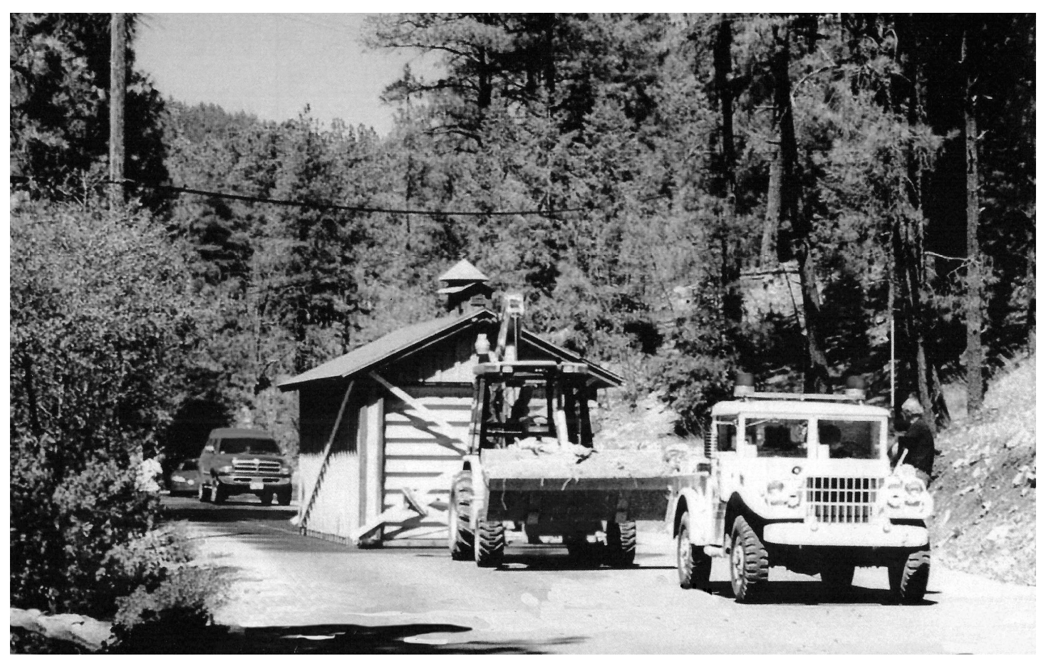
Firehouse Number 1 Being Moved From Humming Bird Lane To Current Location