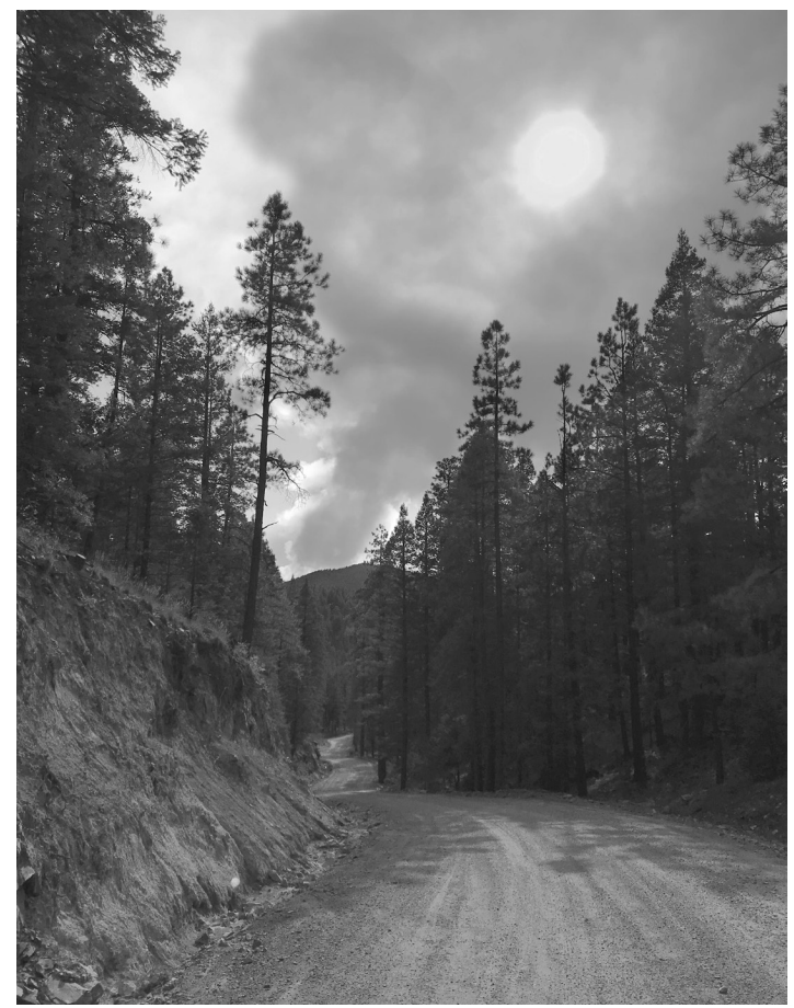
Smoke From Johnson Fire In Sept.

facebook.com/walkerfiredept to disseminate information as well as our longstanding email distribution list, but we would set the expectation that the Facebook page will be updated sooner than an email can go out.