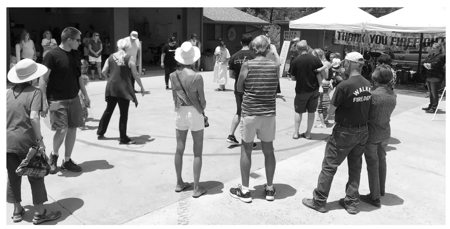
Walker Day Cake Walk

I enjoy seeing everyone coming together whether its at the monthly Board meetings (which everyone is welcome to attend) or enjoying pancakes on a nice Saturday