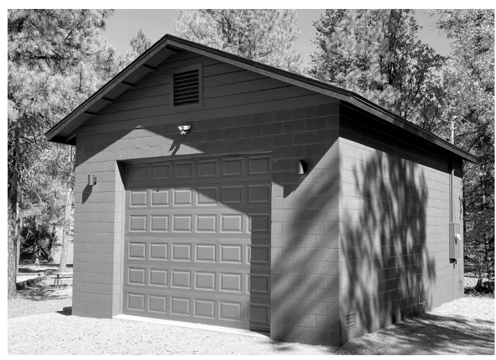
Potato Patch Garage Has Been Completed with representatives of the Walker Fire Department to gather information about what it would take to get this done.

This has been a project that has been discussed going as far back as 1985 and has been pursued in earnest since May of 2012 when the Board of Directors met