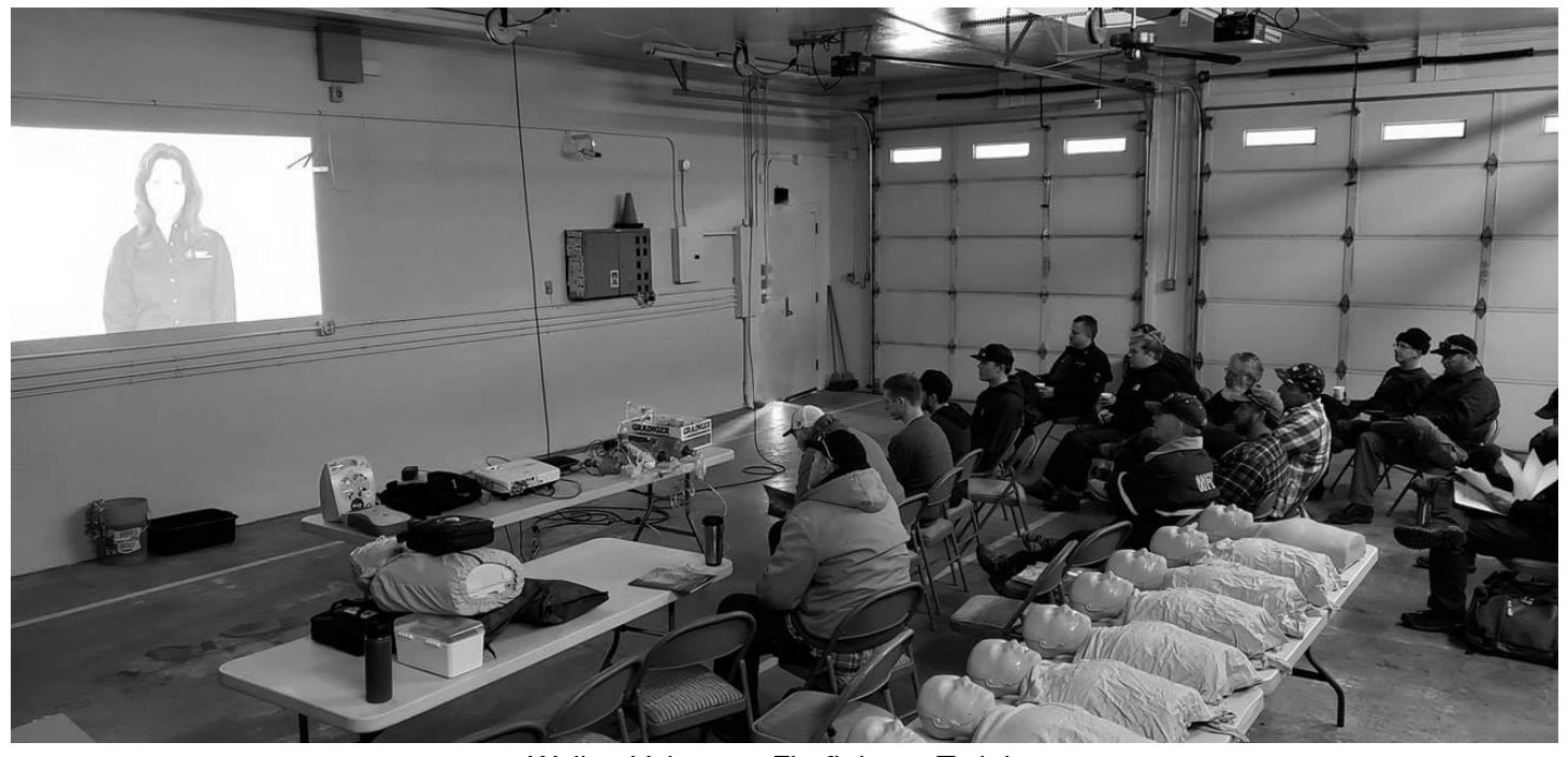
Walker Volunteer Firefighters Training

We have recently discovered the original volunteer list, as well as the plans and the list of materials for that building. It's great to be able to look back at our beginnings.