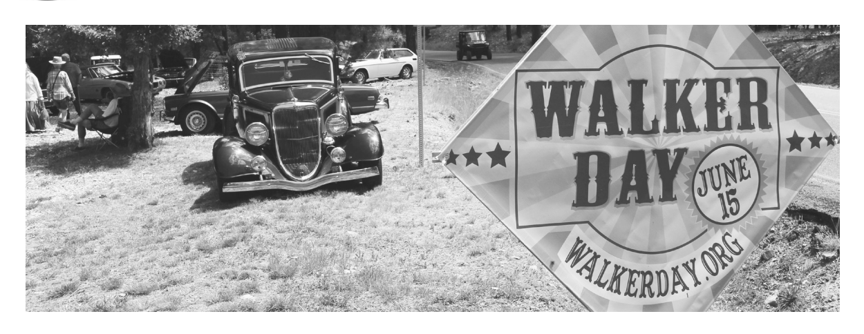
The Walker Fire Protection Association (WFPA) is a volunteer fire department and a non profit, 501(c) 3 organization