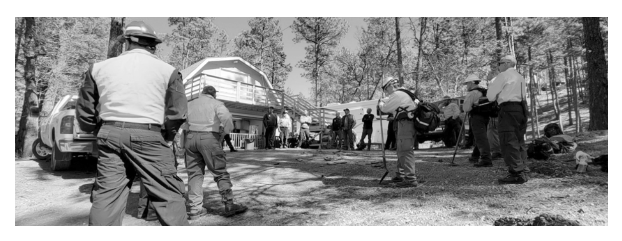
The Walker Fire Protection Association (WFPA) is a volunteer fire department and a non profit, 501(c) 3 organization